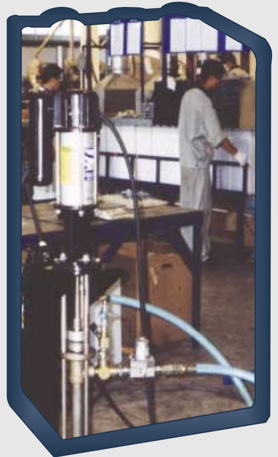
Post seals consist of a two-stage application of epoxy.