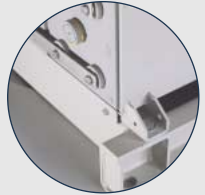
Solid rack construction