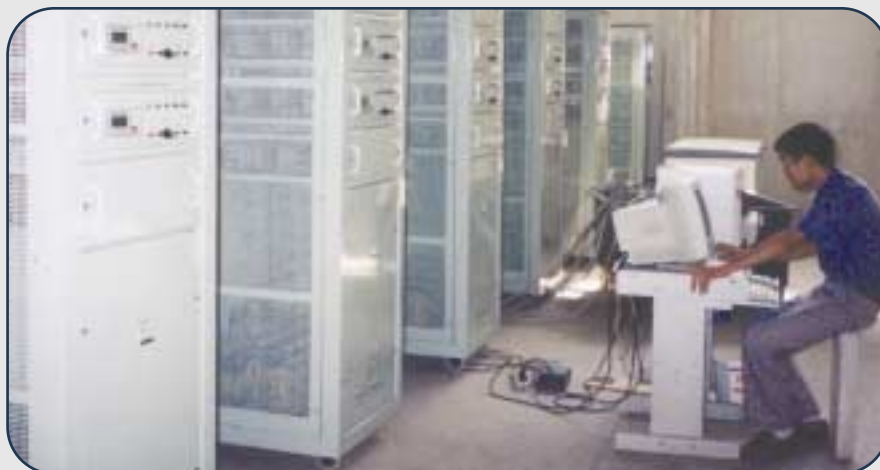
Cells are given high rate and cycle tests in the labs, using large capacity equipment.