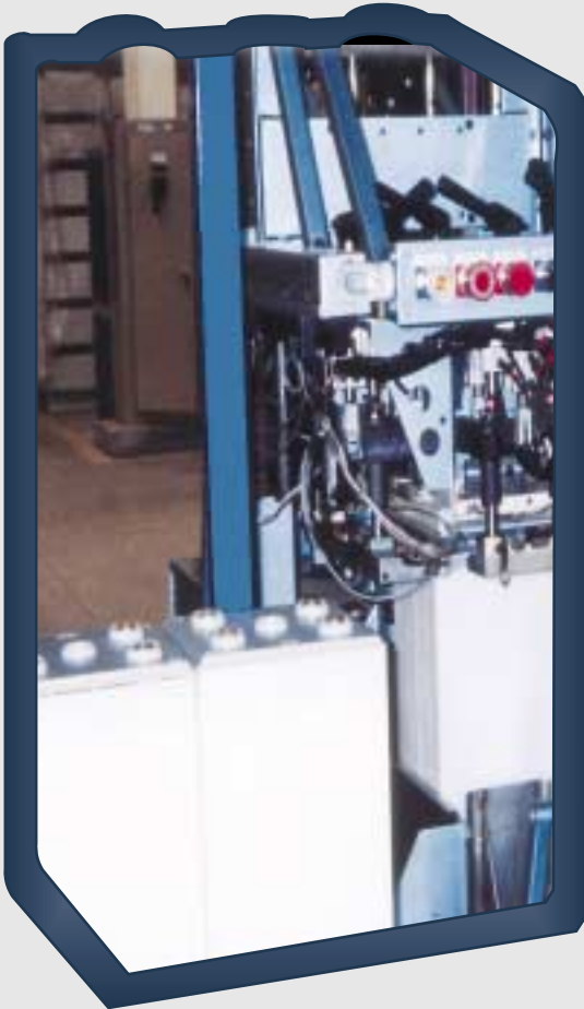
The latest in production equipment is used for constant reliability.